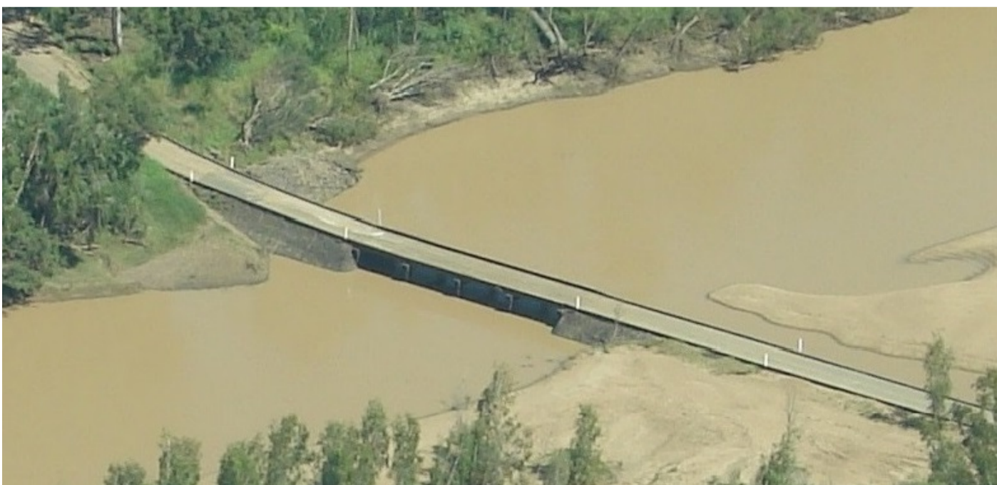
Photograph 1: Riverslea Crossing