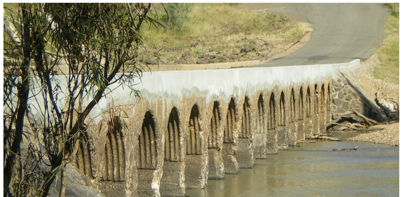
Photograph 2: Foleyvale Crossing

Turtle ramp comprises a purpose built and appropriately graded concrete lined channel with resting pools and attraction flows.